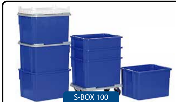
S-BOX 100 Closed