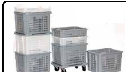
S-BOX 100 Grating