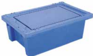
S-BOX With universal lid